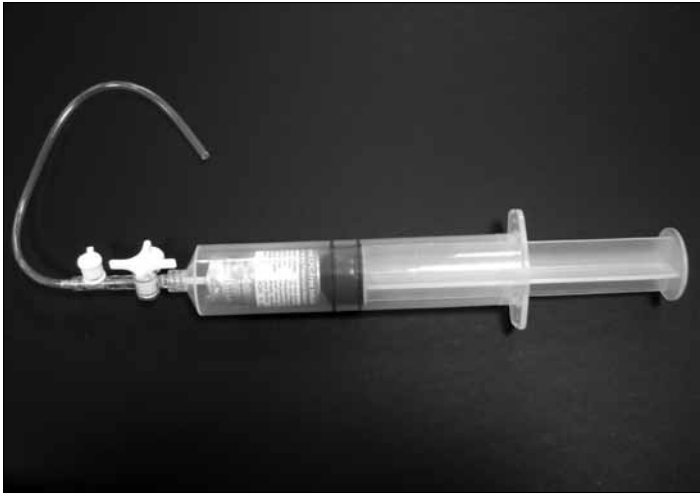
Figure 4. An MDI canister can be placed in the barrel of a 60ml syringe and a 15cm length of IV tubing attached via the Luer lock. Feed the tubing down the ETT and press the plunger to administer the drug, then reconnect the breathing circuit and ventilate