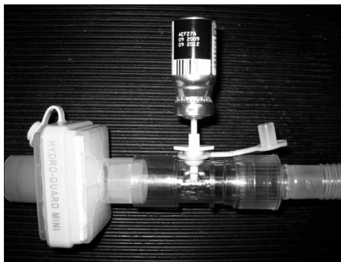
Figure 3. A metered dose inhaler (MDI) adaptor fitted in the breathing circuit, on the patient side of the heat and moisture exchanger. Depress the canister by hand during inspiration to administer the drug

Salbutamol can also be given intravenously. Anticholinergic drugs such as inhaled ipratropium bromide block parasympathetic constriction of bronchial smooth muscle. In unresponsive bronchospasm, consider the use of epinephrine (adrenaline), magnesium sulphate, aminophylline, or ketamine.